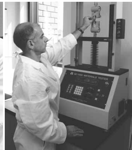
Testing for burst and tensile strength are performed on the B.F. Perkins Mullen® Tester and the Thwing-Albert QC-1000® Materials Tester