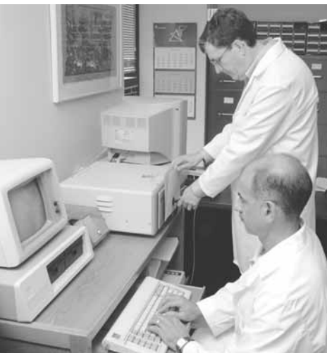
Surface paper colour checked on a MacBeth Spectrophotometer