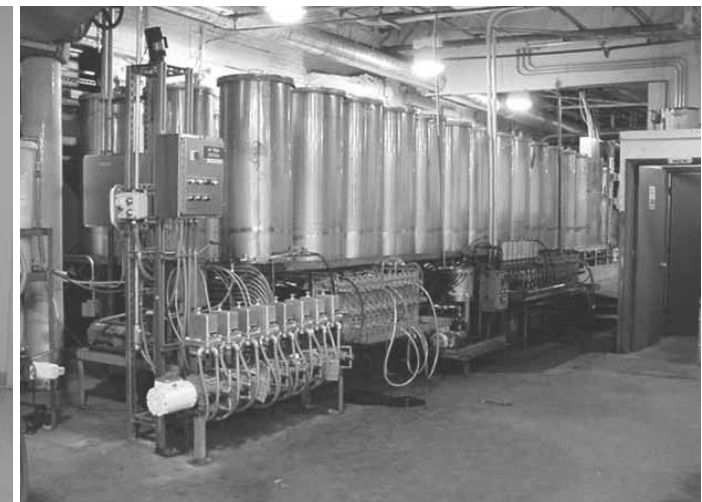
Computer-controlled pigment delivery system monitors and maintains accurate colour match