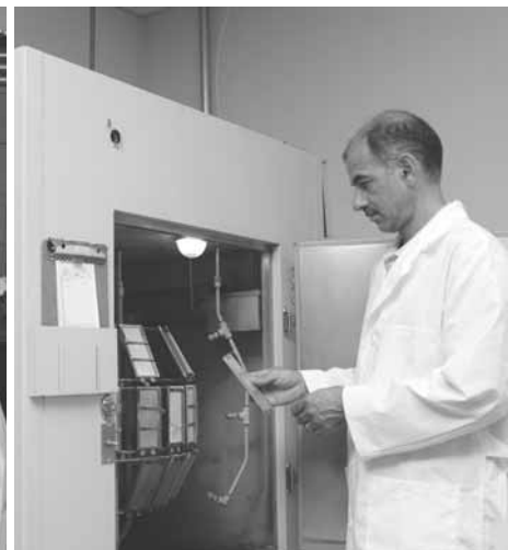
Artcare surface paper colour permanence is tested on an Atlas Xenon Weather-ometer CI35A