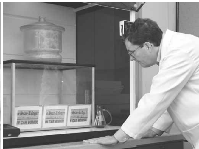
Artcare boards are put through the pollutant absorption test