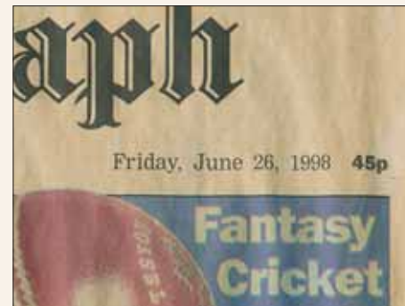
Framed with other mountboard

Actual test showing effect of common indoor airborne pollutants on media framed with Bainbridge Artcare boards