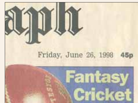
Framed with Bainbridge Artcare

For more science background visit www.artcaremountboard.co.uk