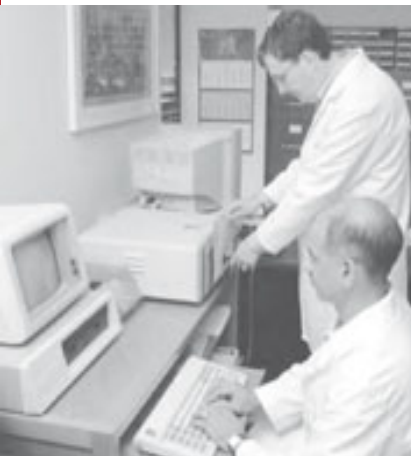
Surface paper colour checked on a MacBeth Spectrophotometer

At Bainbridge we test every delivery of raw materials in our own on-site laboratory so you can rest assured that by choosing Bainbridge your reputation is in good hands.