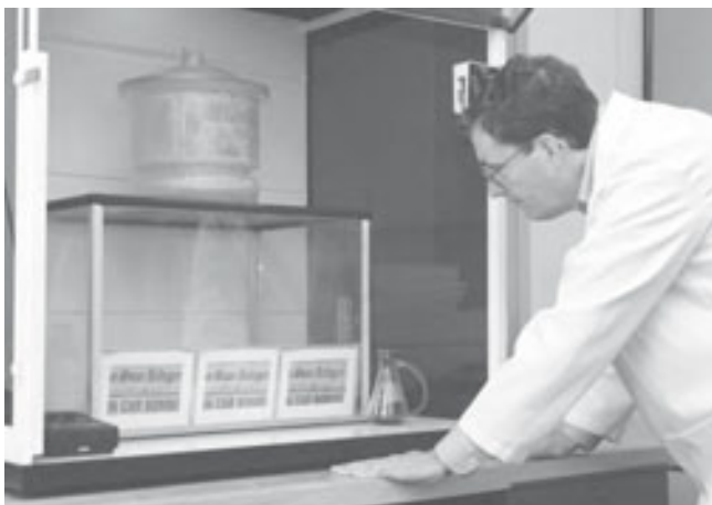
Artcare boards are put through the pollutant absorption test