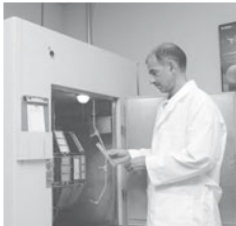
Artcare surface paper colour permanence is tested on an Atlas Xenon Weather-ometer CI35A