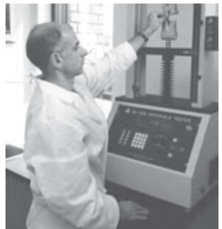
Testing for burst and tensile strength are performed on the B.F. Perkins Mullen® Tester and the Thwing-Albert QC-1000® Materials Tester